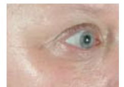
Post 3 treatments