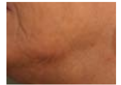
Post 2 treatments