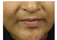
Post 4 treatments