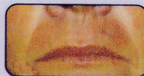
30 Days After Treatment