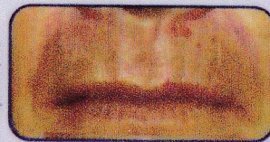
Immediately After Treatment